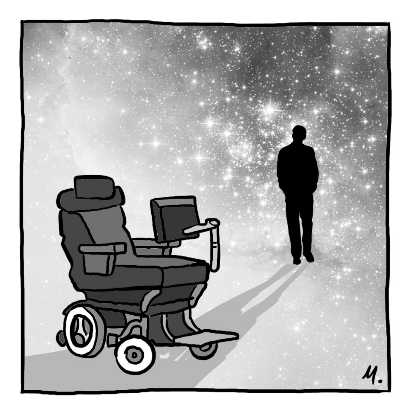
Image by Mitchell Toy <a href="https://i.redd.it/os0f96hutql01.jpg">https://i.redd.it/os0f96hutql01.jpg</a>